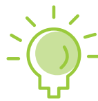
MPS (Managed Print Services)

When it comes to technology products and services, we focus on six key areas — offering value and knowledge to you through our team of skilled experts.